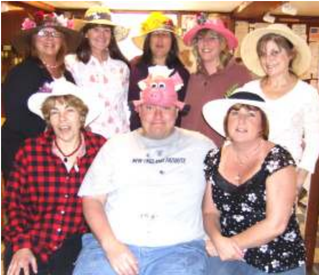
The Ladies in there Derby Bonnets along with "Miss Piggy" in the center.